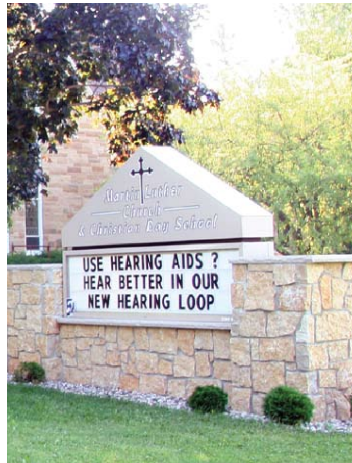
Martin Luther Evangelical Lutheran Church, Oshkosh, WI

This simple technology, which also enables a home TV to broadcast through one's hearing aids, is now being advocated by a growing number of hearing leaders. In 2010, the Hearing Loss Association of America ("the nation's voice for people with hearing loss") and the American Academy of Audiology (the world's largest association of hearing professionals) announced a joint "collaborative public education campaign 'Get in the Hearing Loop.'" The campaign aims "to enlighten and excite hearing aid users, as well as audiologists and other professionals who dispense hearing aids, about telecoils and hearing loops and their unique benefits." Hearing loops are coming to America.