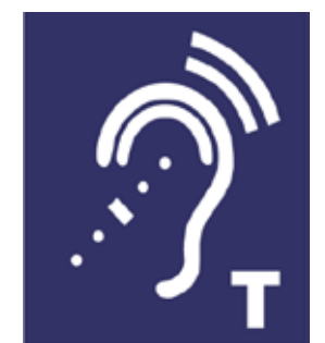
HEARING LOOP INSTALLED Switch hearing aid to T-coil