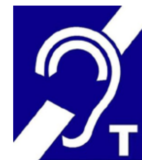
HEARING LOOP INSTALLED Switch hearing aid to T-coil

Induction loop systems are used worldwide and are required to meet the established international standard IEC 60118-4 as developed under the auspices of the IEC (International Electrotechnical Commission). This standard defines the strength of the magnetic field, frequency response and methods of measuring these requirements. It also specifies the maximum levels for electromagnetic background noise. Compliance with the standard will be the result of correct equipment specification, wiring loop design and installation and requires verification.